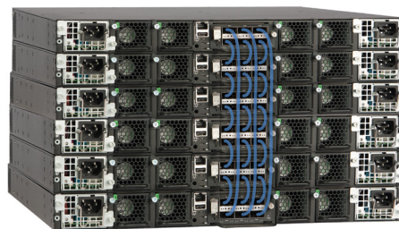
Figure 4: Up to 12 Ruckus ICX 7750 Switches can be stacked using up to 12 standard full-duplex 40 Gbps QSFP+ ports per switch, providing up to 5.76 Tbps of aggregated stacking bandwidth.

Ruckus Multi-Chassis Trunking (MCT) supports dual homing of wiring closet access switches, or servers in a rack, to two Ruckus ICX 7750 switches in an MCT peer group, eliminating the risk of a single point of failure. In conjunction with MCT, VRRP-E (the Ruckus extension to VRRP for MCT) provides redundancy and sub-second failover for both Layer 2 and Layer 3. For metro or campus deployments in a ring topology, the Ruckus Metro Ring Protocol (MRP-I and MRP-II) prevents Layer 2 loops and enables faster re-convergence than Spanning Tree Protocol (STP) with sub-second failover.